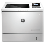
HP Color LaserJet Enterprise M553n

Speed and color are the perfect pair for your business. That's why this energy-efficient printer and Original HP Toner cartridges with JetIntelligence combine to produce vibrant, professional-quality documents right when employees need them.