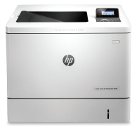
HP Color LaserJet Enterprise M553dn