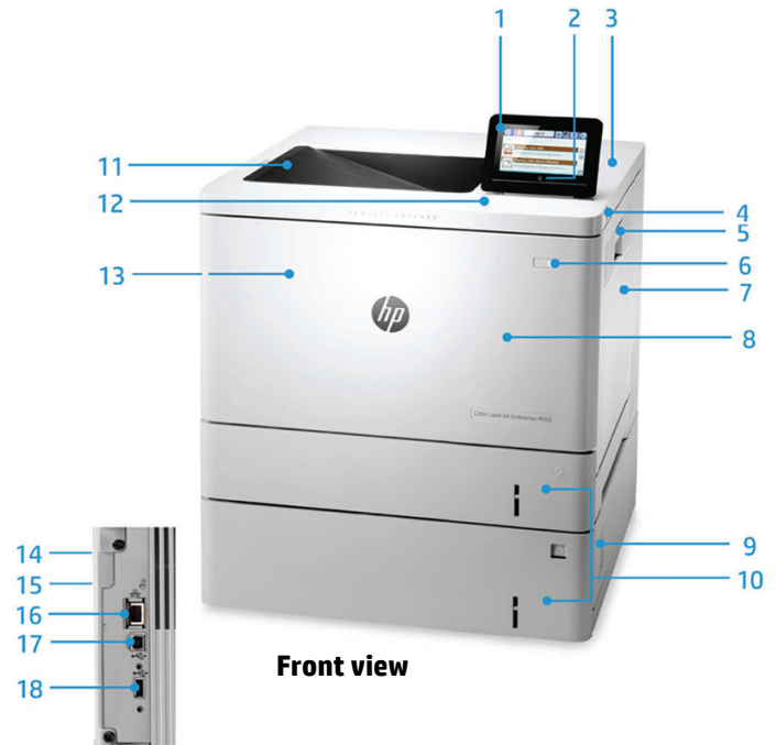
Close-up of I/O ports